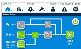
User Friendly 5" Touch Panel

All specifications are subject to change without prior notice.