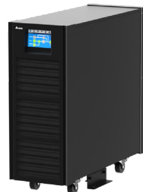
Optional IP42 solution